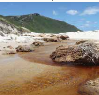
Below left Conspicuous Cliff. Below John Rate Lookout.