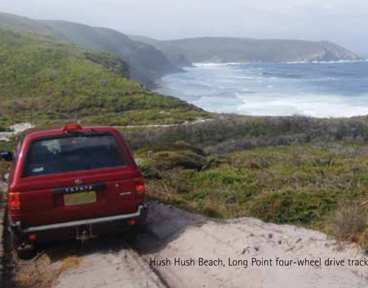
Hush Hush Beach, Long Point four-wheel drive track.

This stretch of coastline can be hazardous due to large unpredictable waves and swells, slippery rocks and strong currents. Fishing along this coastline can be dangerous.