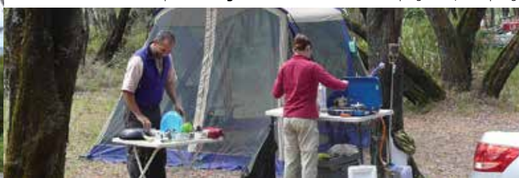
Above Banksia camp. Above right Fernhook Falls. Below Camping at Crystal Springs.

It is accessible by two-wheel-drive vehicles and is not suitable for caravans.