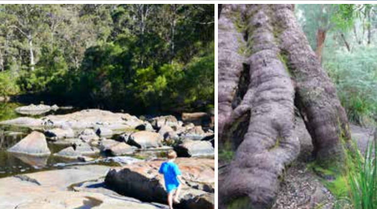
Top Coalmine Beach. Above Circular Pool. Above right Giant Tingle Tree.