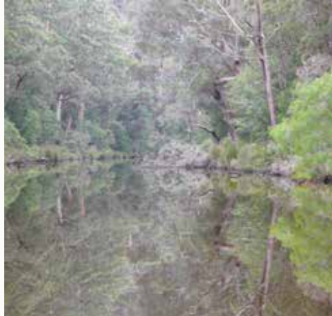
Above left Mandalay Beach. Above Monastery Landing.