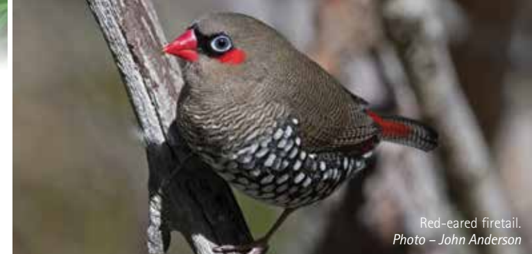
Red-eared firetail.