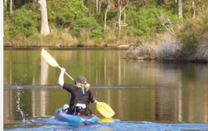
Above Paddling on the Frankland River.