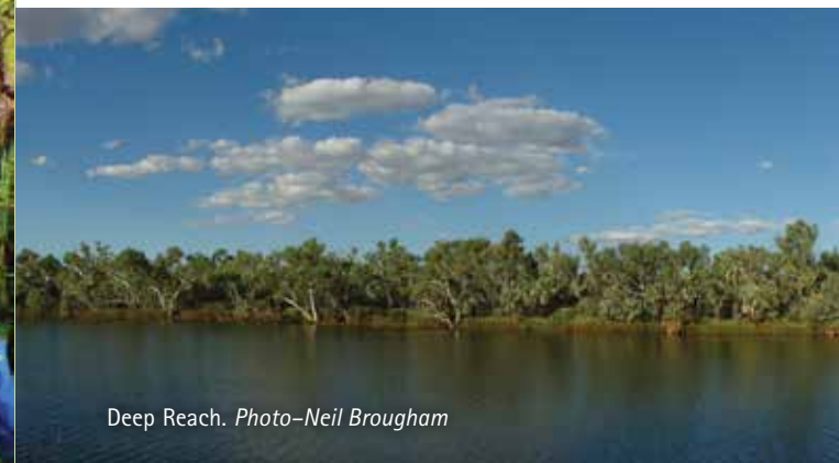
Deep Reach.

Many areas in the park are culturally significant to Aboriginal people. Please do not interfere with cultural sites. Do not swim in the waters around the homestead and behave respectfully at Deep Reach Pool.