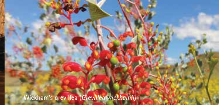
Wickham's grevillea ( Grevillea wickhamii )