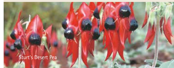
Sturt's Desert Pea

The Millstream area is a priority one catchment and, used in tandem with the Harding Dam, the aquifer supplies water to industry and for domestic use to the people of Wickham, Roebourne, Point Samson, Dampier and Karratha. The water level is constantly monitored and, in times of low water, pumps can be used to keep the Millstream pool topped up and flowing—an essential safeguard for the long-term survival of the wetland and its dependent wildlife.