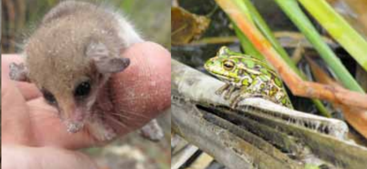
Below left Pygmy Possum Below right Motorbike Frog

D'Entrecasteaux is a special place with many secrets to discover and enjoy.