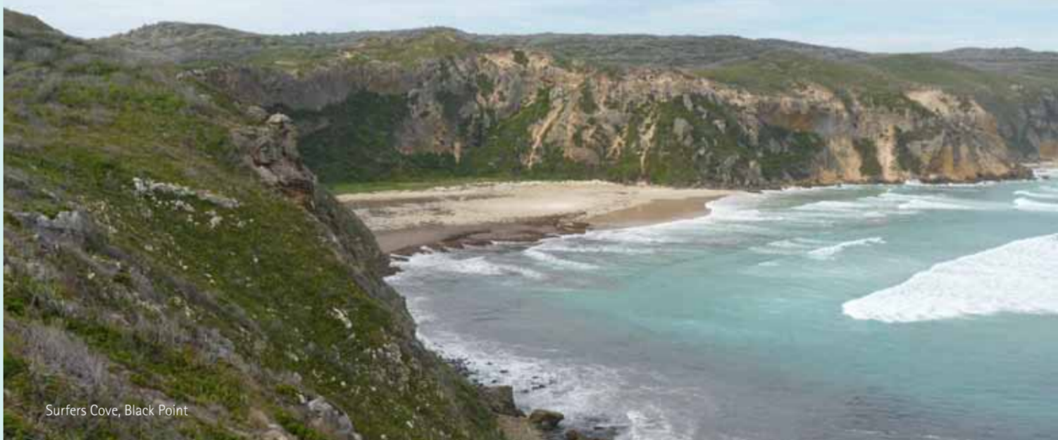
Surfers Cove, Black Point

Fatalities have occurred in D'Entrecasteaux National Park. Remember, your safety is our concern but your responsibility.