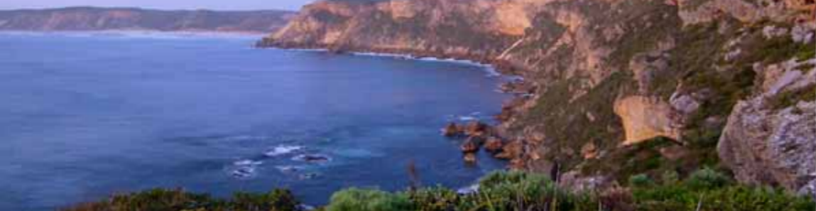
Point D'Entrecasteaux Tookulup

People who are onshore should send for help, keep the person in the water in sight and throw buoyant objects into the water.