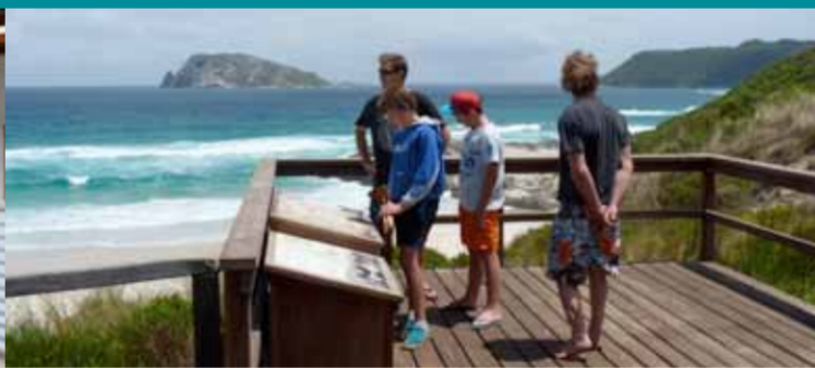
Above Mandalay Beach lookout