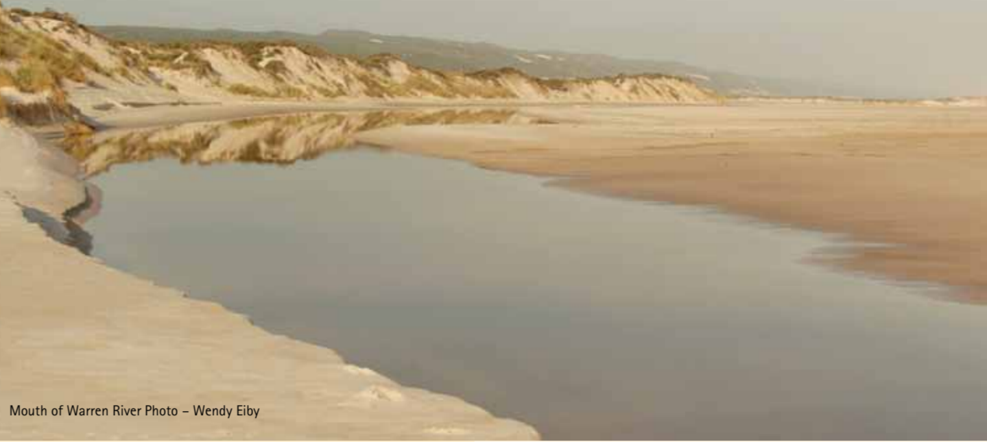
Mouth of Warren River