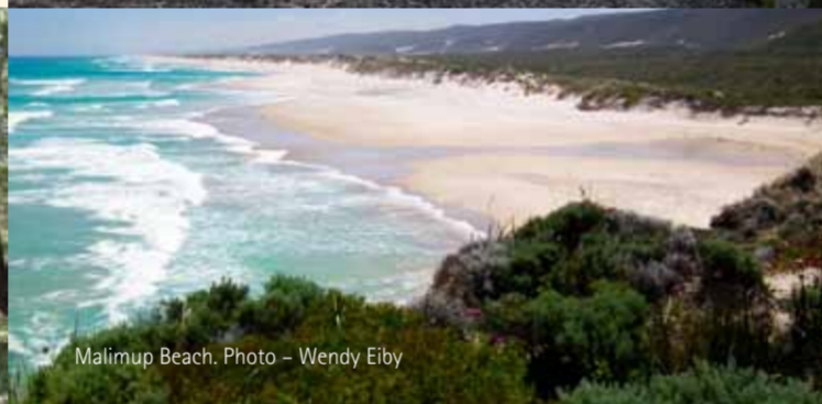
Malimup Beach.