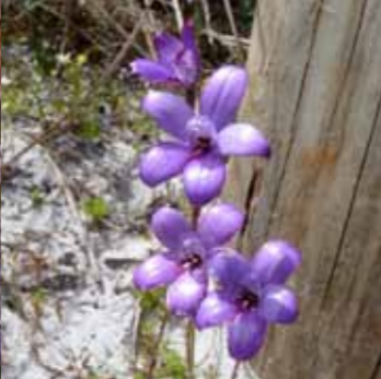
Below Elythranthera brunonis

Consider carrying a personal locator beacon in areas of poor or unreliable mobile coverage.