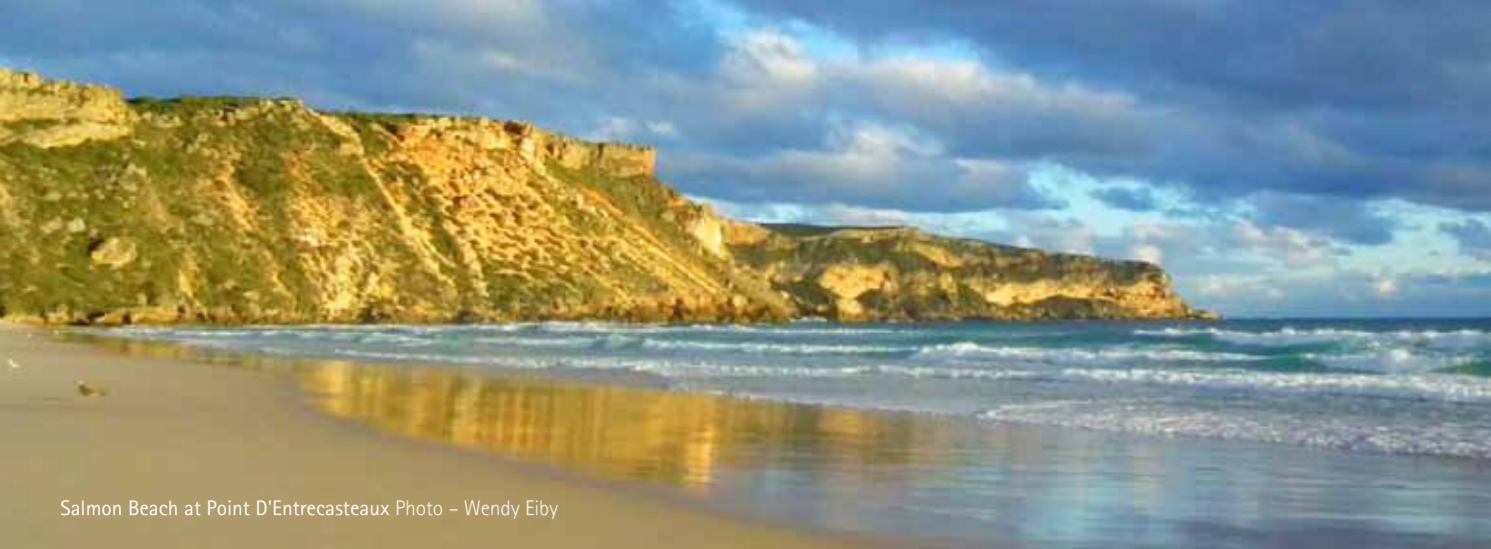
Salmon Beach at Point D'Entrecasteaux