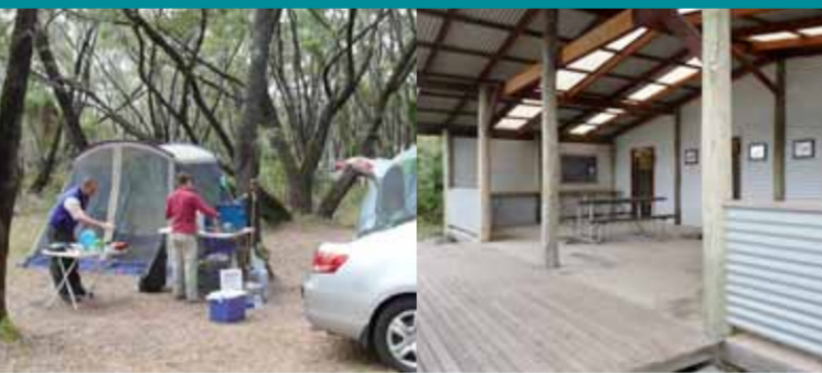
Above Crystal Springs campsite Above right Banksia Hut at Banksia Camp