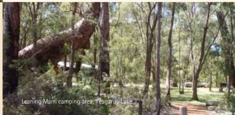
Leaning Marri camping area, Yeagarup Lake

There are three walk-in camp sites at Lake Jasper and they are regularly full in the warmer months. Black Point and Carey Brook offer camping nearby if Lake Jasper is full.