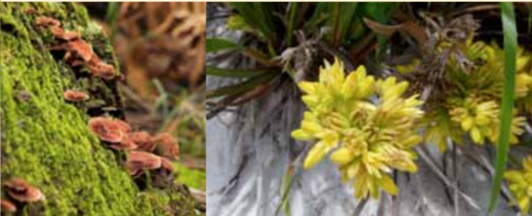
Below Fungi on jarrah at Yeagarup Lake Below right Conostylis sp.