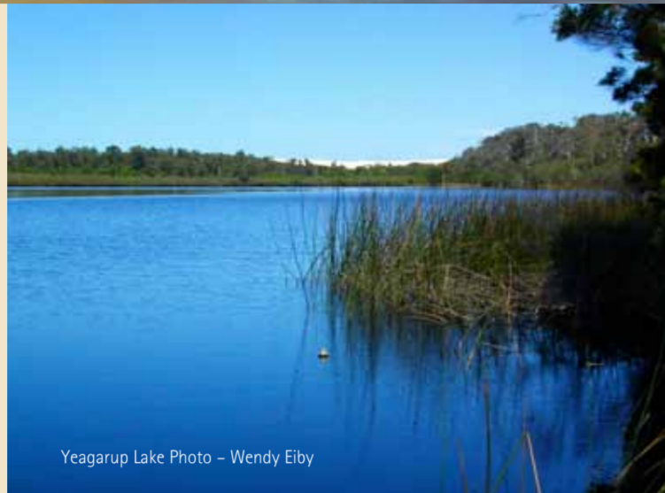
Yeagarup Lake

There are 30 campsites tucked into the peppermint trees at Black Point. It's a great place to base yourself to explore this coastline.