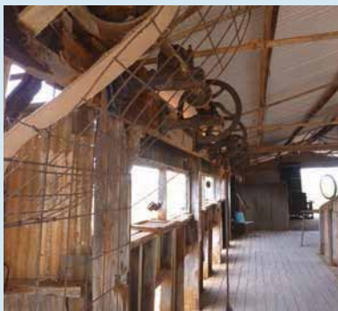
Right Shearing shed at Peron Heritage Precinct

Throw in a line and enjoy the fishing at Cattle Well.