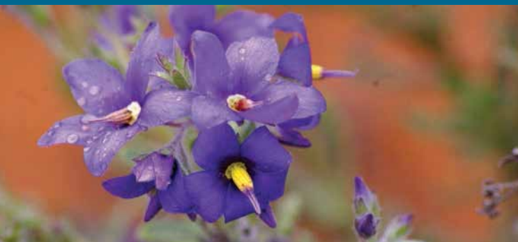
Below Halganias on red sand hills.