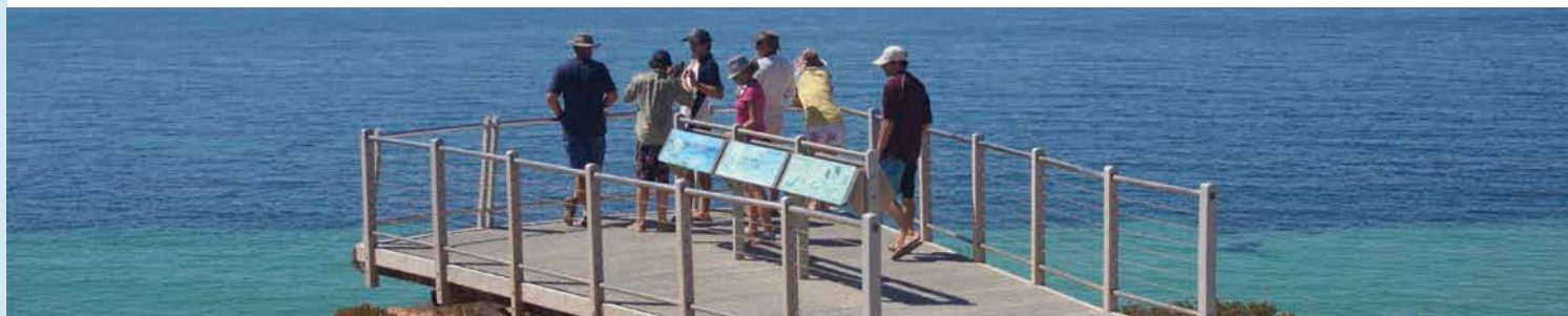
Below Lookout at Skipjack Point

Keep an eye out for the remains of a fish canning factory established in 1933 and converted to a fish freezer in 1938. The freezer was closed in 1947 when a new freezer plant was built in Denham. You can launch small boats here over very soft sand.