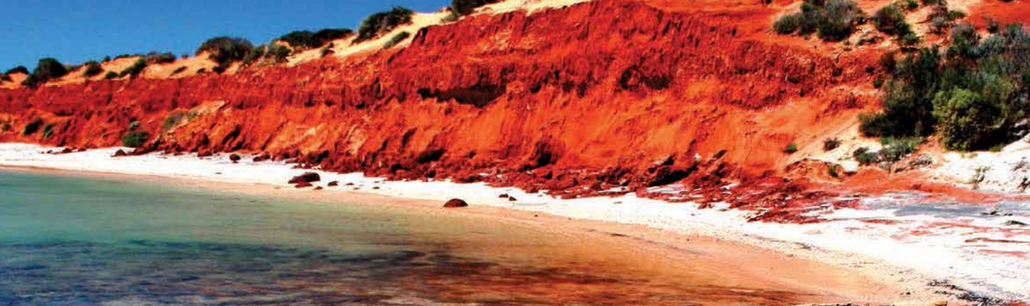
Above Bottle Bay.