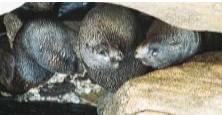
Above New Zealand fur seal.