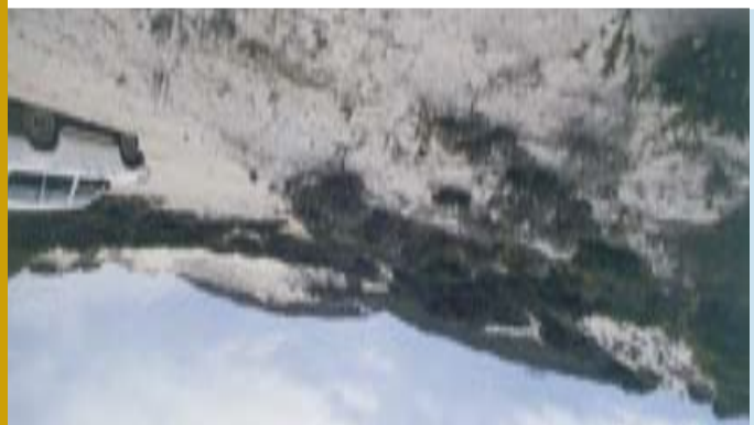
Above Yeagarup dunes, D'Entrecasteaux National Park.