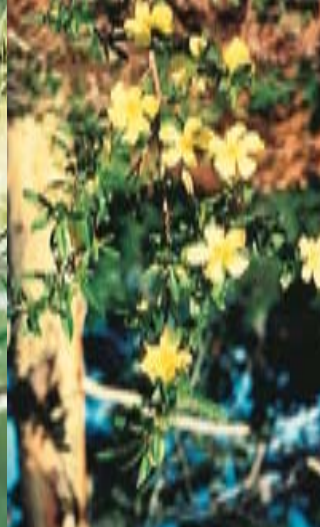
Right Hibbertia sp. Centre right Western pigmy possum ( Cercartetus concinnus ). Far right Donnelly River.

Park visitors can experience the coast by conventional vehicle on sealed roads but those in four-wheel drives can explore further. D'Entrecasteaux is a special place with many secrets to discover and enjoy.