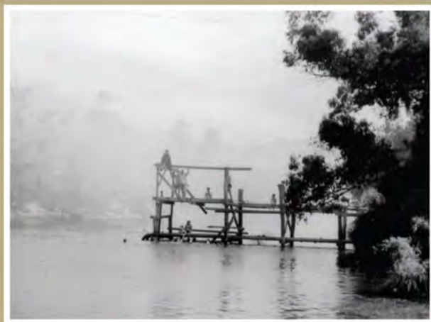
Swimming in Millard's Pool c. 1960